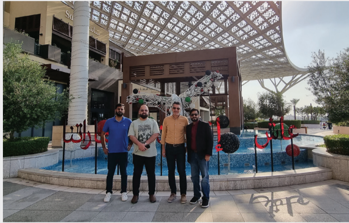
Visit of IACPL delegate to Al Zahia shopping mall, a project of Khatib & Alami (International Designer of our Reem Heights, a mix use development)

A visit of senior architect wing was arranged to gain in-depth knowledge and understanding of the design process employed by K&A, by gelling IACPL managers in K&A working environment and by engaging IACPL's key individuals with K&A key teams. IACPL explored K&A's design philosophy, creative design methodologies, collaborative team approaches, and the deployment of modern technologies and software in their projects.