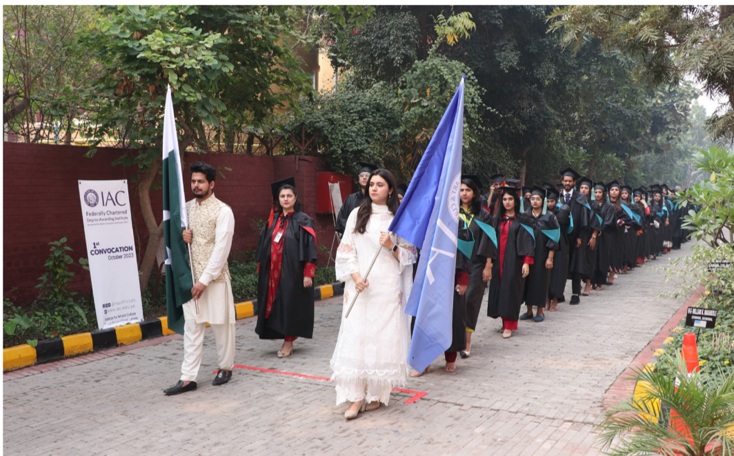
Procession of faculty members of School of Art along with graduating students