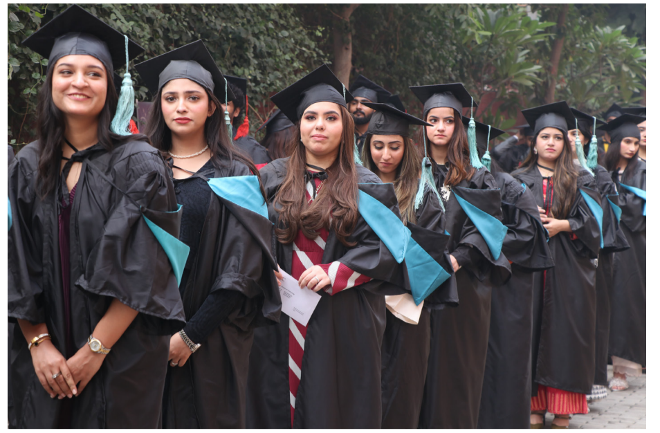
Procession of School of Art graduating Students at the IAC First Convocation