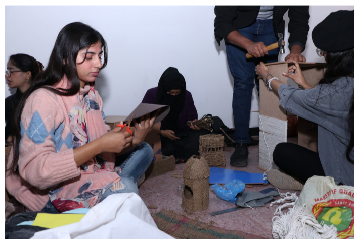
Foundation year students working diligently on their projects using different materials and creating variety of forms