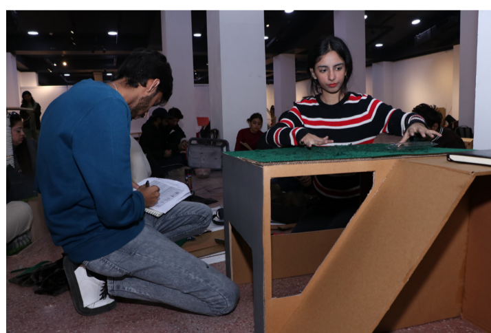
Students coming up with creative outcomes by exploring different materials with a problem solving approach

“He who works with his hands and his head is a craftsman. He who works with his hands and his head and his heart is an artist”- Francis of Assisi