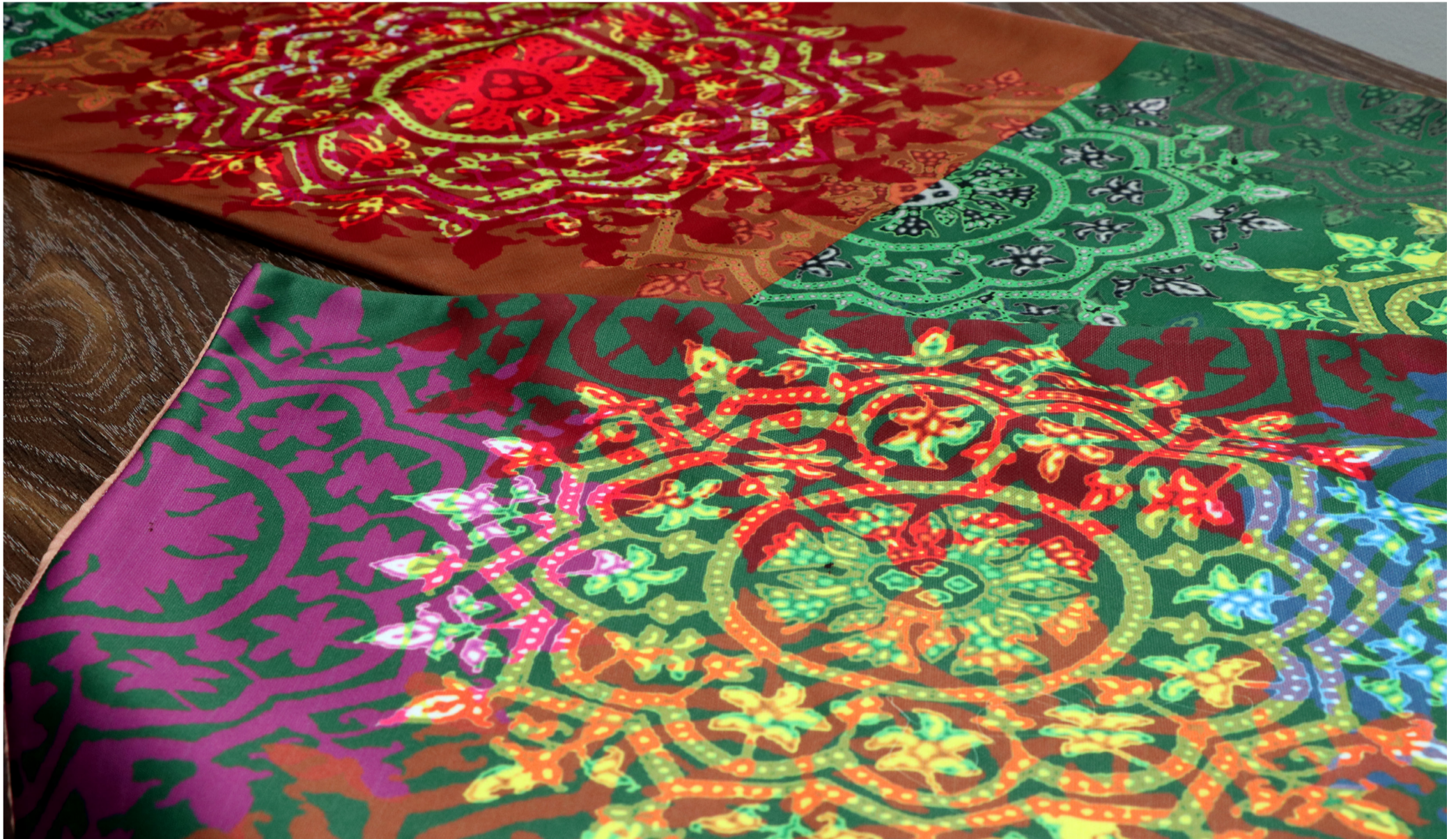
Table runner designs created by 6th semester Textile design student Shanzay Eman Akhtar